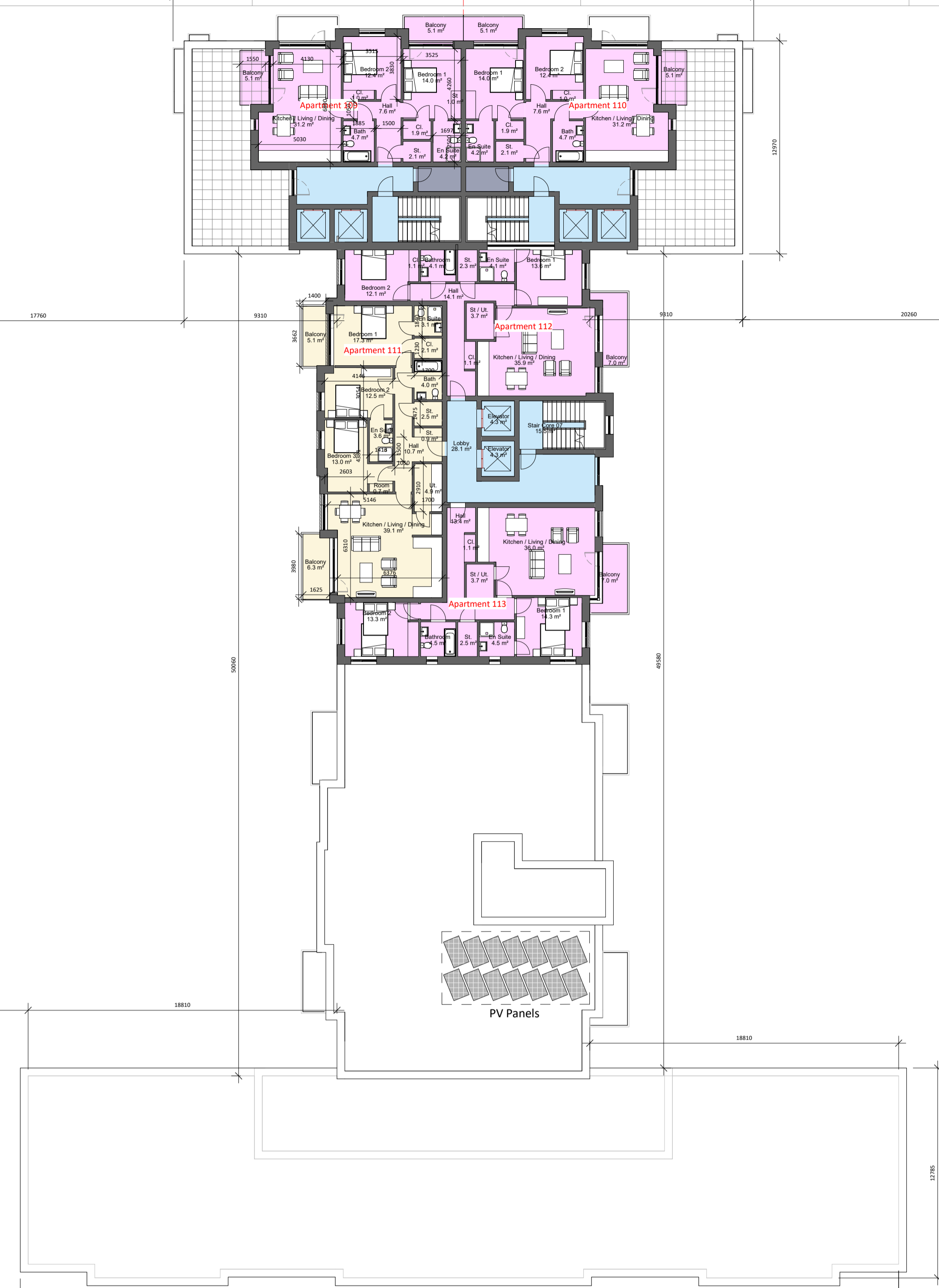
Sector 7 Block 2