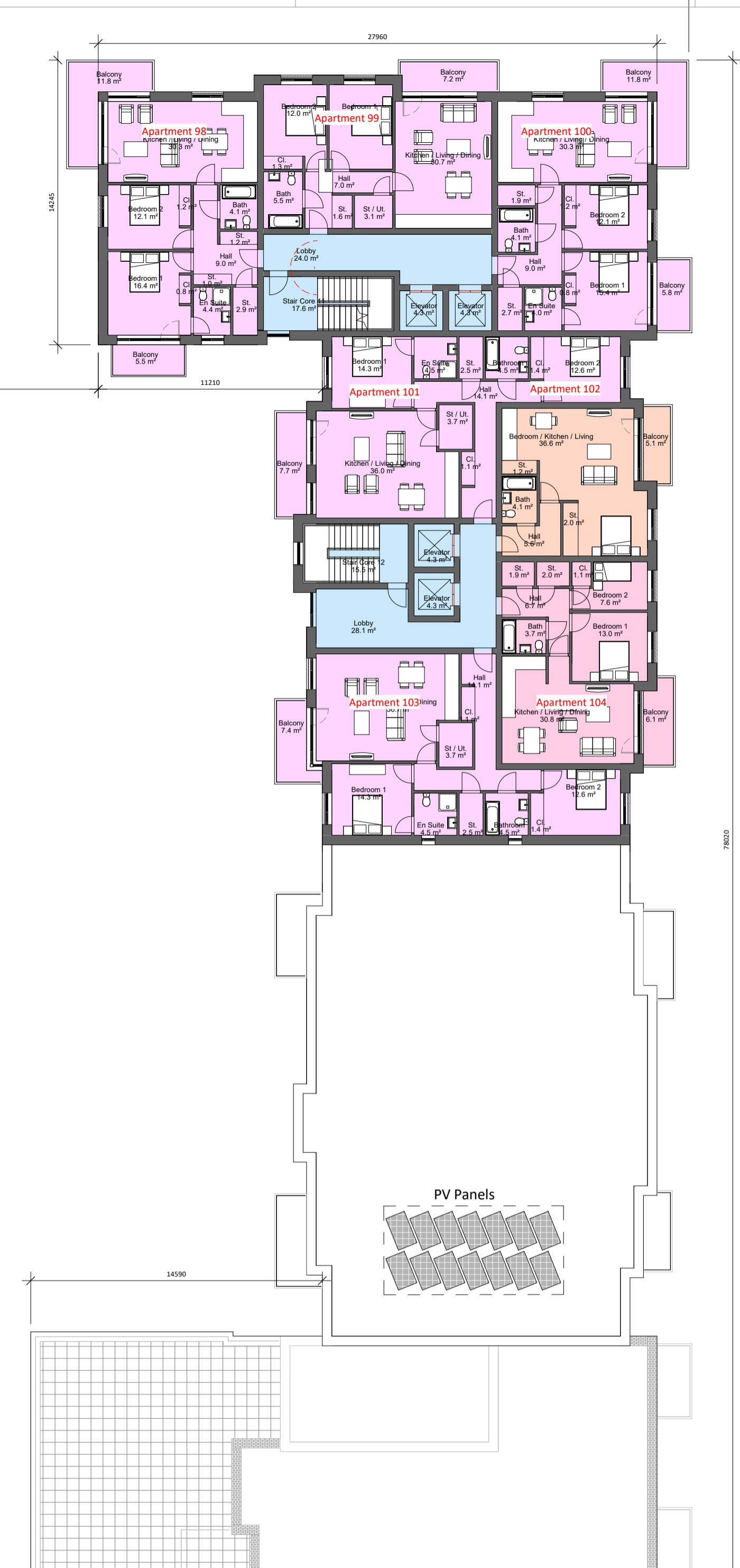
Sector 7 Block 3